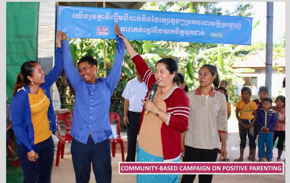
COMMUNITY-BASED CAMPAIGN ON POSITIVE PARENTING

The campaign was rally walked by 445 parents and teenagers from every village in the targeted commune to meet together at the commune office. Key stakeholders who represented district governor, commune leaders, parents, and children gave speeches to the audiences to address the importance of positive parenting to end violence against children. A short performance about positive parenting intervention was arranged by a commune-based working group in the campaign event to promote the audience (parents) attention to an understanding of positive parenting as well as prevention and protection children from any forms of abuses.