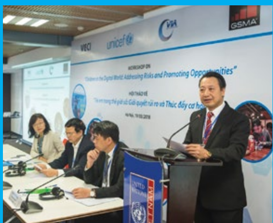
Secretary-General of the Viet Nam Chamber of Commerce and Industry addressing the participants.

UNICEF EAPRO collaborated with the Global System for Mobile Communications Association (GSMA) on two national workshops with the ICT industry in Indonesia and Viet Nam in March 2018. It was the first time UNICEF EAPRO had engaged with governments on children's rights in the ICT sector. Following the Hanoi workshop, the Embassy of Sweden asked UNICEF Viet Nam to co-organize the Viet Nam Internet Forum in October 2018 in Hanoi, where a full breakout session on "Children in the Digital World" will be organized by Lund University and UNICEF Viet Nam. Additionally, June 2018 was named as the Month of Action on Child Digital Safety by the Vietnamese Government. The workshop in Jakarta included participants from ministries of information, justice, and women and children's affairs, as well as representatives of Twitter and other major companies in the ICT sector in Indonesia. After the workshop, UNICEF Indonesia carried out a U-Report consultation with 20 young people who reported feeling unsafe at times on the Internet because of the risk of violence, and the uncertainty of the identity of social media users they encounter online. UNICEF Indonesia will continue to engage with the Government as it develops a national road map on child online protection.